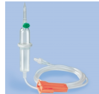
Intrafix® infusion sets